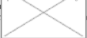
image not found https://www.lawebredonda.es/gestonable/sites/all/themes/ideas/s... [11] molt ajustat tibles amb