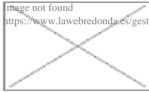
image not found https://www.lawebredonda.es/gestionable/sites/all/themes/md_minimal/images/screenshot.png