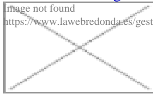
image not found https://www.lawebredonda.es/gestionable/sites/all/themes/meeting/screenshot.png