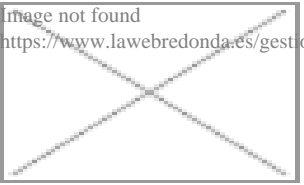
image not found https://www.lawebredonda.es/gestione/sites/all/themes/havas [5]