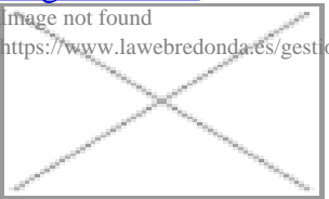
image not found https://www.lawebredonda.es/gestione/sites/all/themes/magaz [23]