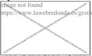
image not found https://www.lawebredonda.es/gestione (hiya/in scegliere il [8]

arriva nel suo template che desidera. I template definitivi verranno quindi personalizzati con il suo logo, il suo slogan e le sue richieste, nei limiti consentiti dallo schema prescelto. Non consideri inoltre i piccoli disallineamenti che potranno presentarsi rispetto alle pagine proposte, perché gli stessi verranno eliminati nella versione definitiva.