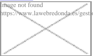
image not found https://www.lawebredonda.es/gestione (interiora) [14]