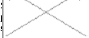
image not found https://www.lawebredonda.es/gestione (dei modelli s [9] verso modello redonda.com [10]