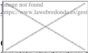
image not found https://www.lawebredonda.es/gestione (bili [1] [6]