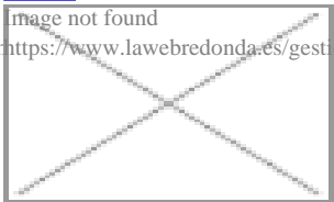
image not found https://www.lawebredonda.es/gestione (https:// [13]