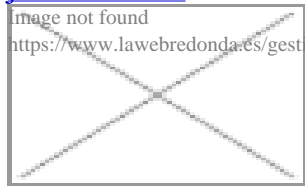
image not found https://www.lawebredonda.es/gestione (https:// [18]